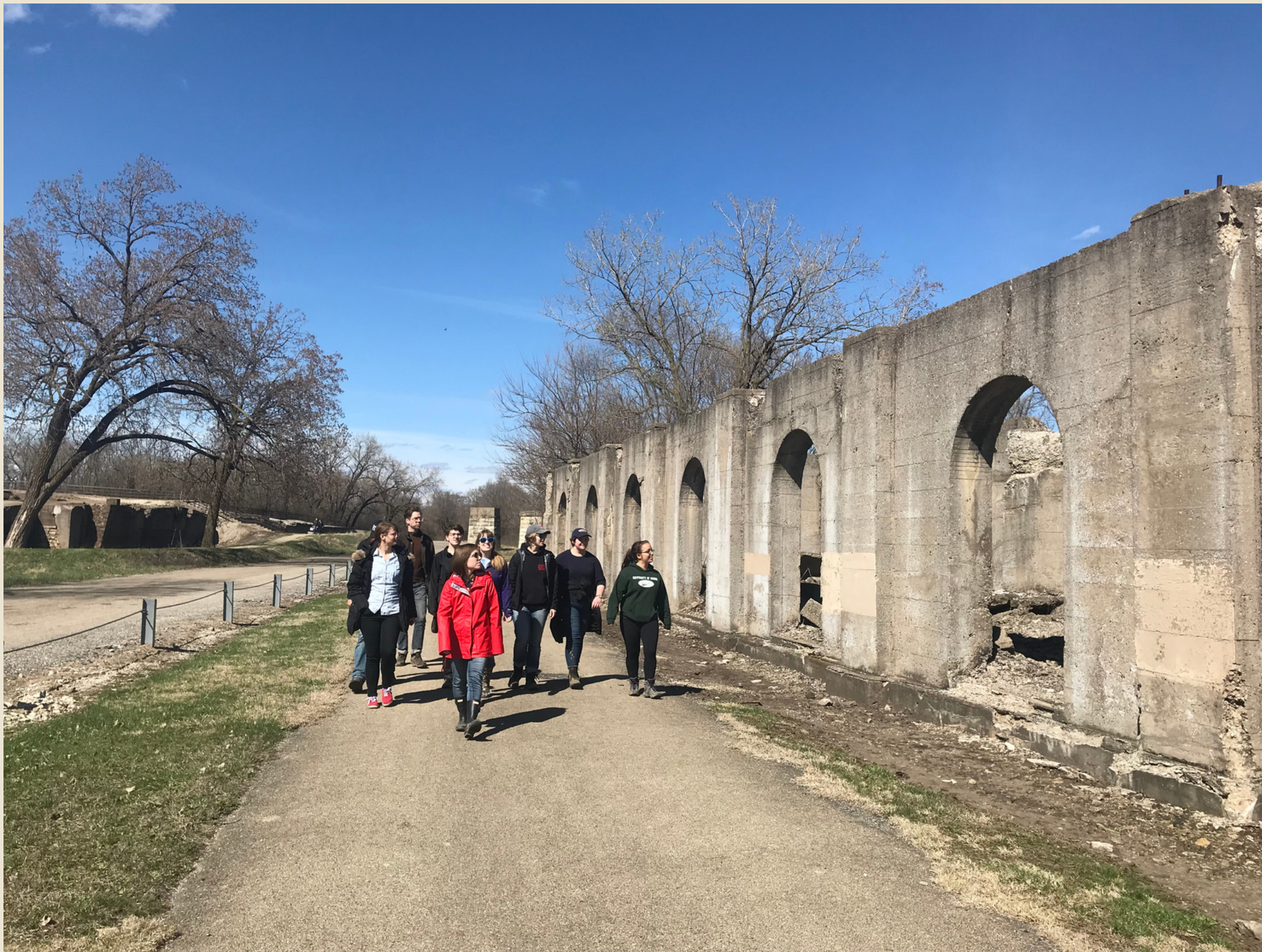
Loyola Public History graduate students tour the Joliet Iron Works Historic Site at the Will County Forest Preserve for HIST 481: Management of Historical Resources.